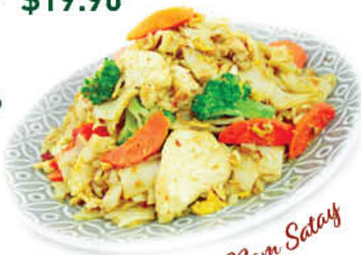
82. Pad Nam Satay

Rice noodle with bokchoy, bean sprout in spicy soup