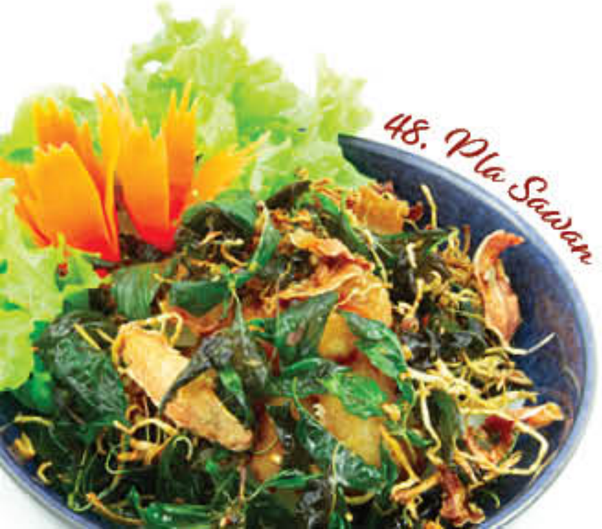
48. Plaa Sawan

***Let our staff know if you have any food Allergies***