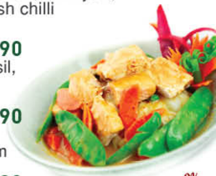
47. Panang Salmon

Crispy fried barramundi fillet, lemongrass, ginger, basil, mild dressing