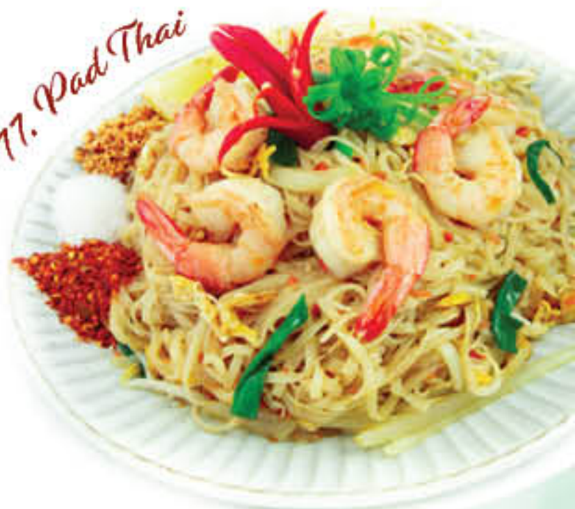
77. Pad Thai

rice noodle with egg, dry shrimp, tofu and tamarind sauce