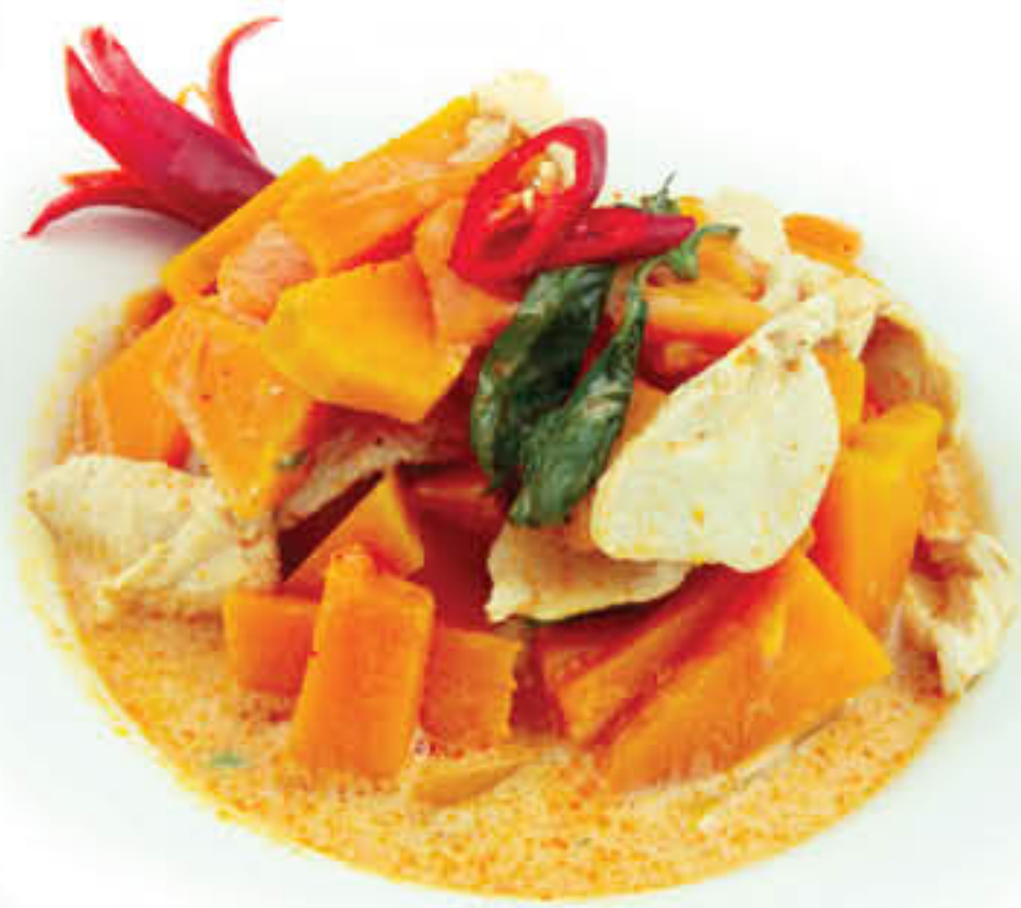
49. Red Pumpkin Curry