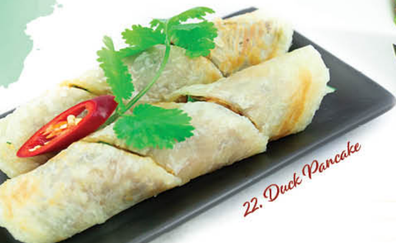
22. Duck Pancake

***Let our staff know if you have any food Allergies*** All price inclusive GST | Price subject to change without notice