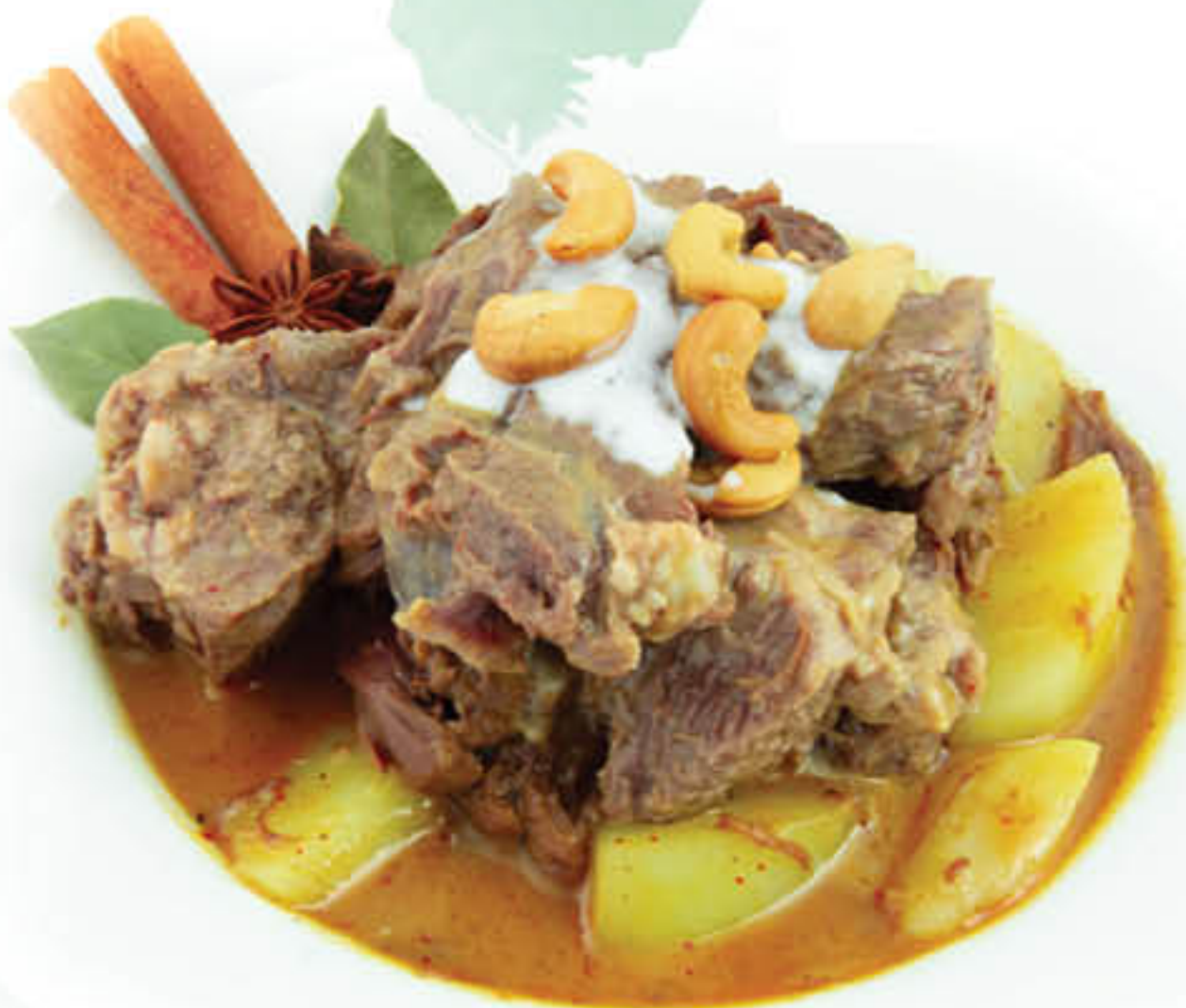
55. Massaman Beef