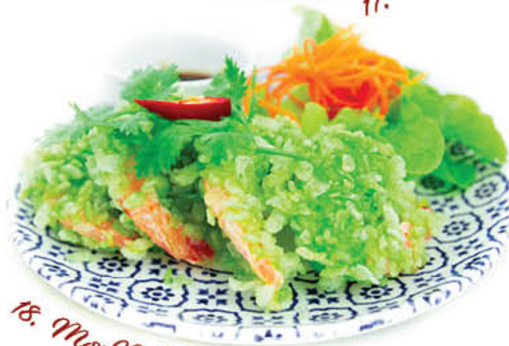
18. Mor Ra Kot