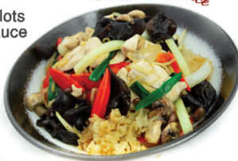
62. Ginger Sauce

Fresh ginger, mushrooms, shallots in yellow bean sauce