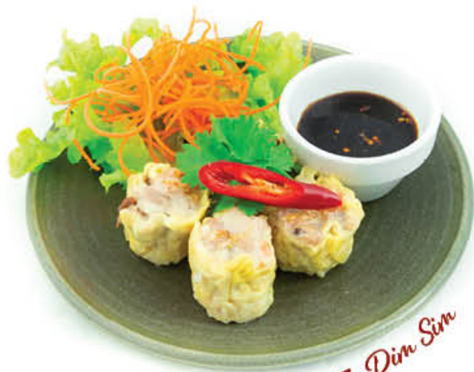
17. Dim Sim