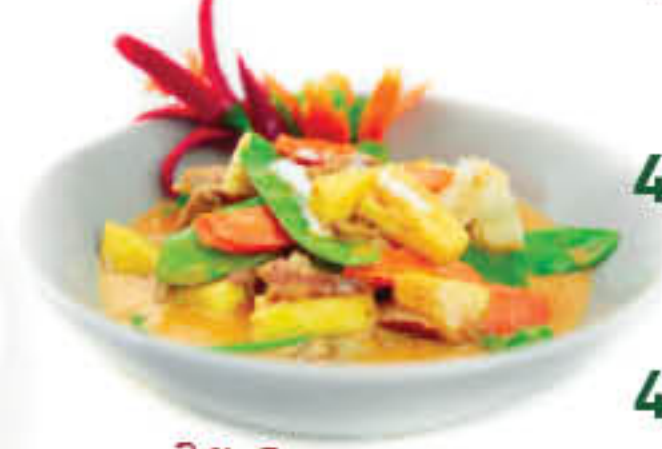
34. Pad Ped