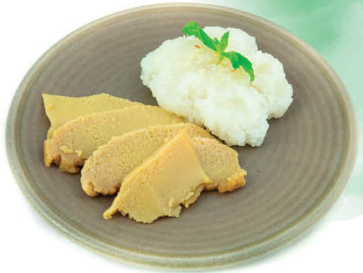
88. Khao Neaw Kow

89. KHAO NEAW DUM $10.90 Black sticky rice with roasted banana