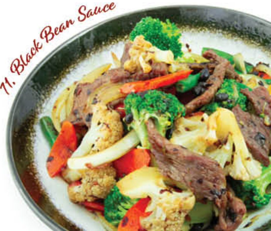
71. Black Bean Sauce

***Let our staff know if you have any food Allergies***