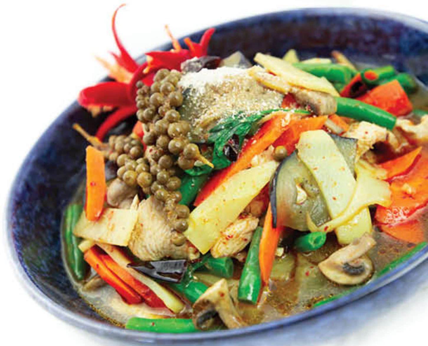
52. Jungle Curry