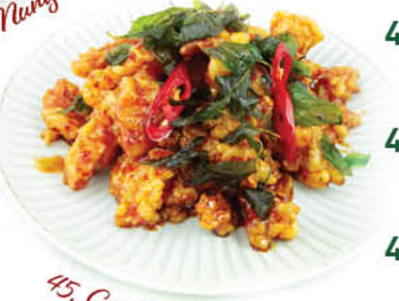
45. Gai Grob