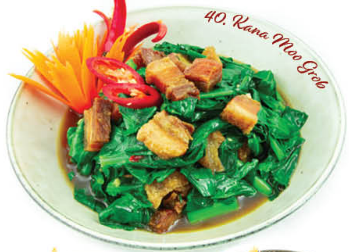
40. Kana Moo Grob

King prawns with minced chicken and curry sauce