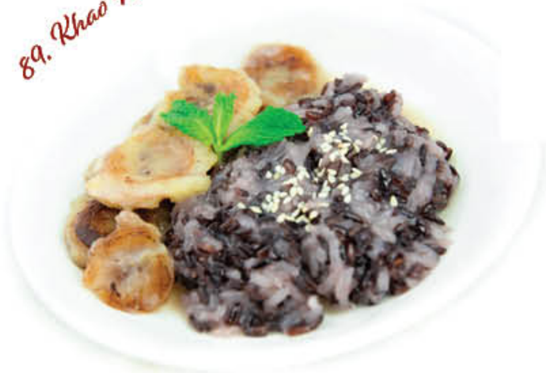
89. Khao Neaw Dum