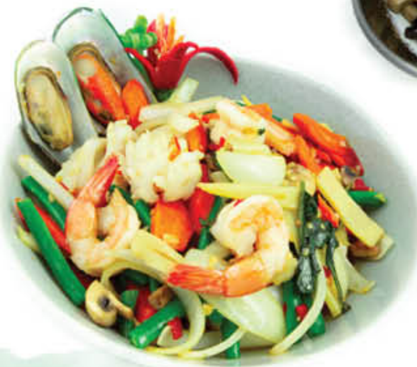
61. Chilli Basil

Broccoli, fresh chilli, fried onions, chilli jam, and tamarind sauce