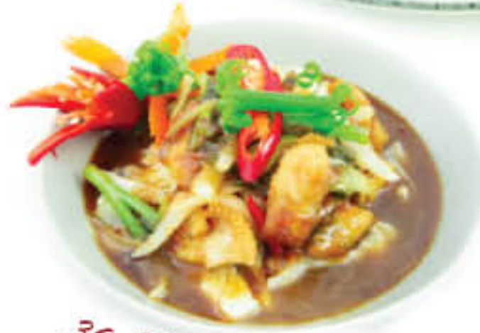
36. Plaa Khing