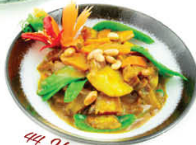
44. Hang Lae Moo