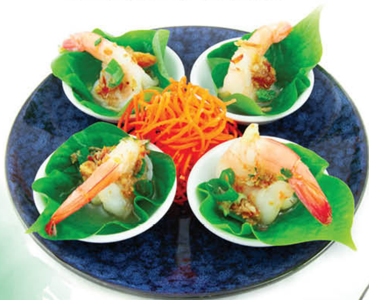
20. Prah Goong