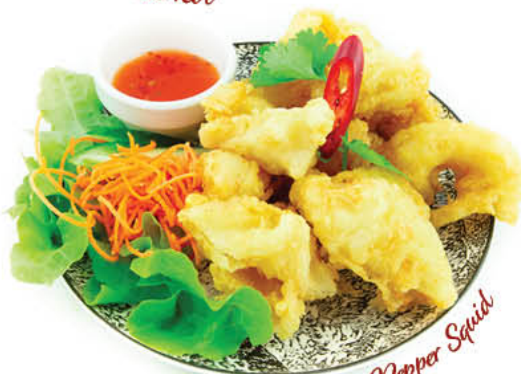
19. Salt & Pepper Squid