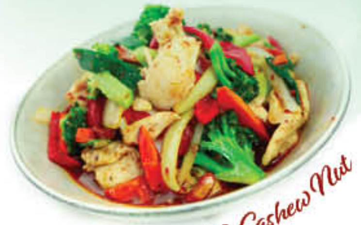
57. Cashew Nut