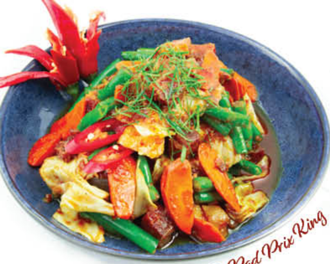
68. Pad Prik King