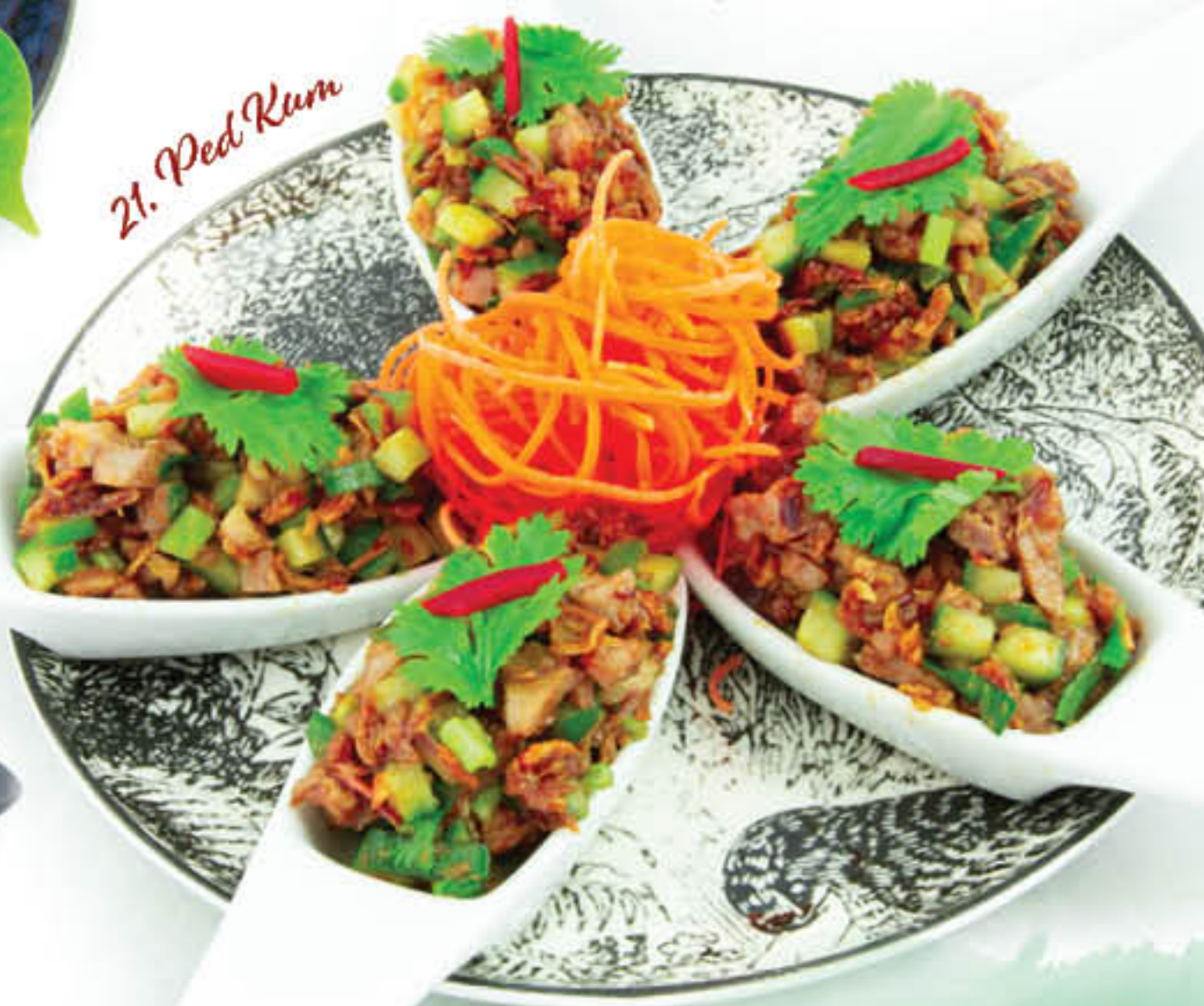
21. Ped Kum